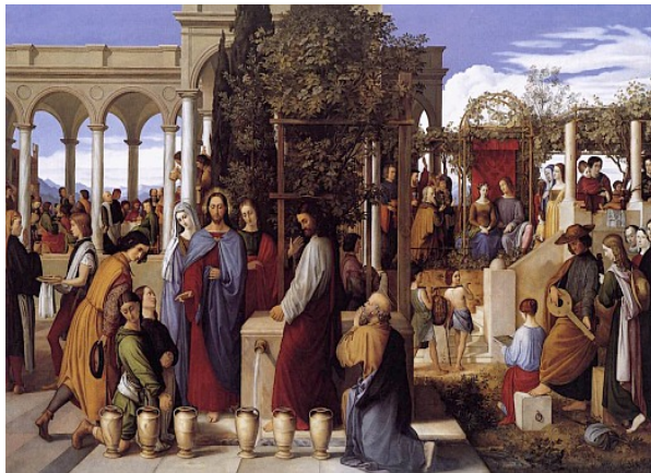
The Wedding at Cana

God's Plan for a Joy-Filled Marriage is a one-day seminar for engaged couples. It provides couples with a rich understanding of the teachings of the Church and offers them the tools to live married life as God intended.