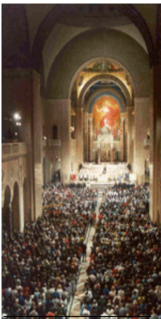
National Prayer Vigil for Life - Basilica of the National Shrine of the Immaculate Conception, Washington, DC

January 22, 2009 marks the 36 th anniversary of Roe v. Wade , the Supreme Court decision that legalized abortion throughout all nine months of pregnancy. Each year thousands of people gather in Washington, DC on this anniversary to March for Life.