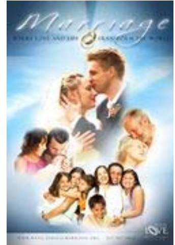
MARRIAGE. Where life and love transform the world!

Visit www.masscatholicmarriage.org to preview the materials. More resources are being added on a regular basis.